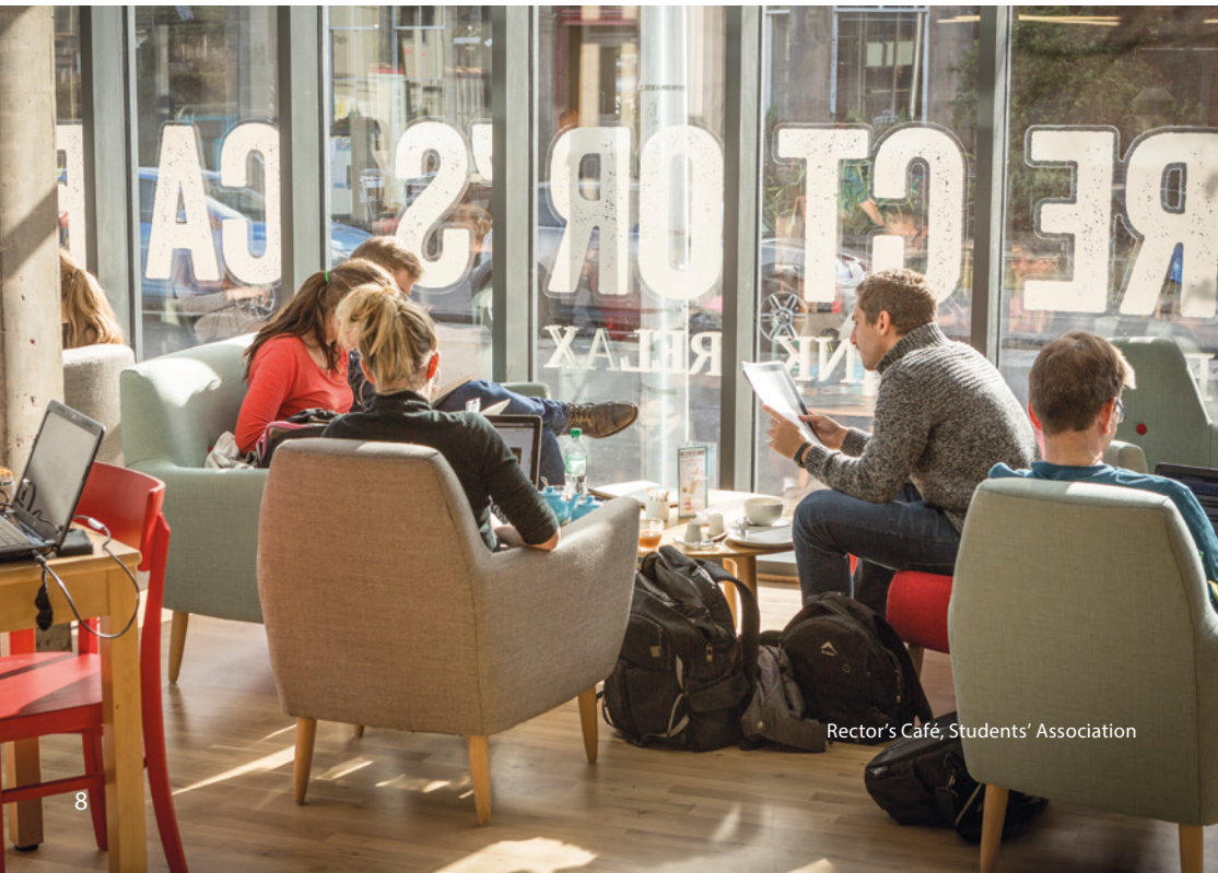
Rector's Café, Students' Association

Our students' creative talents are also on show through our student newspapers , radio and film production , offering you the chance to do everything from host your own radio show to getting involved in student journalism.