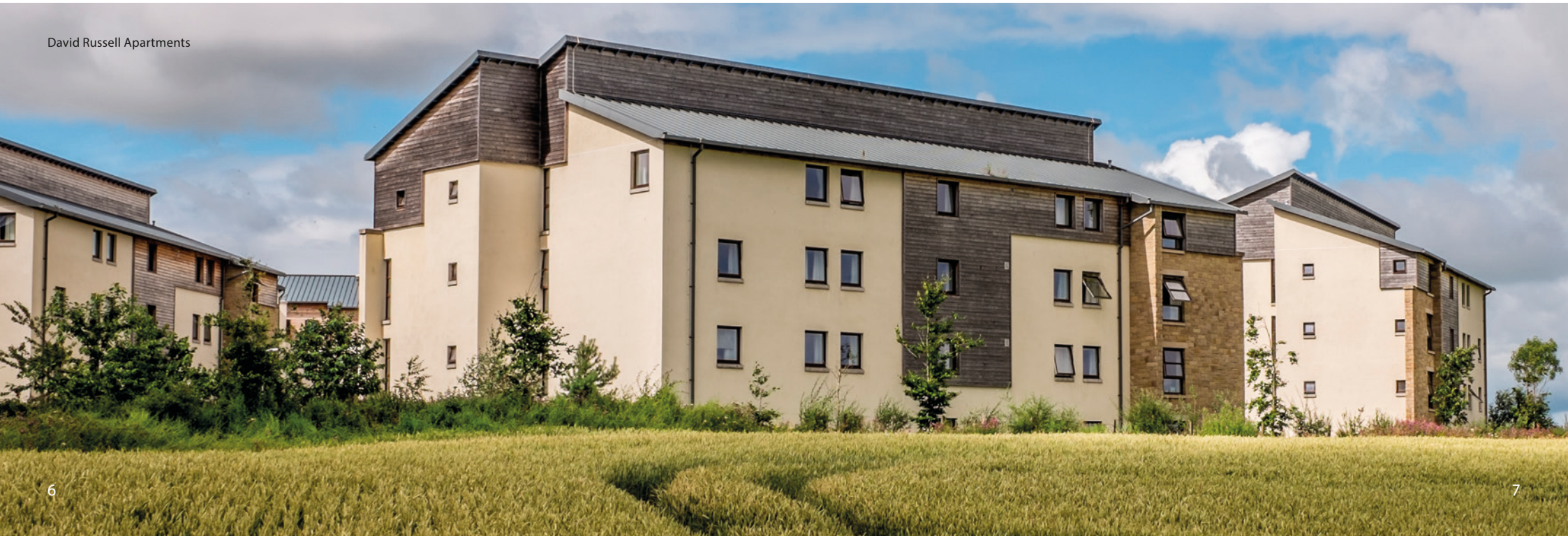
David Russell Apartments