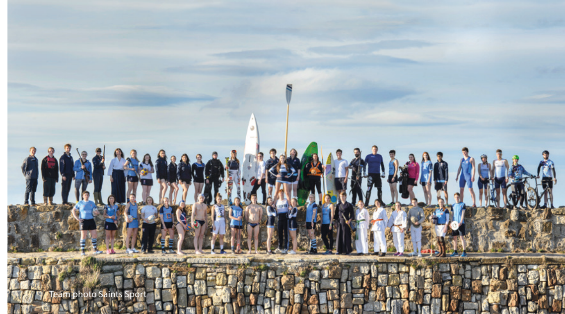
Team photo Saints Sport

As you might expect from a university that is over 600 years old we have a number of traditions that are unique to St Andrews that you can take part in. These include our famous shaving foam fight, running into the sea at dawn on 1 May and wearing gowns on formal occasions.