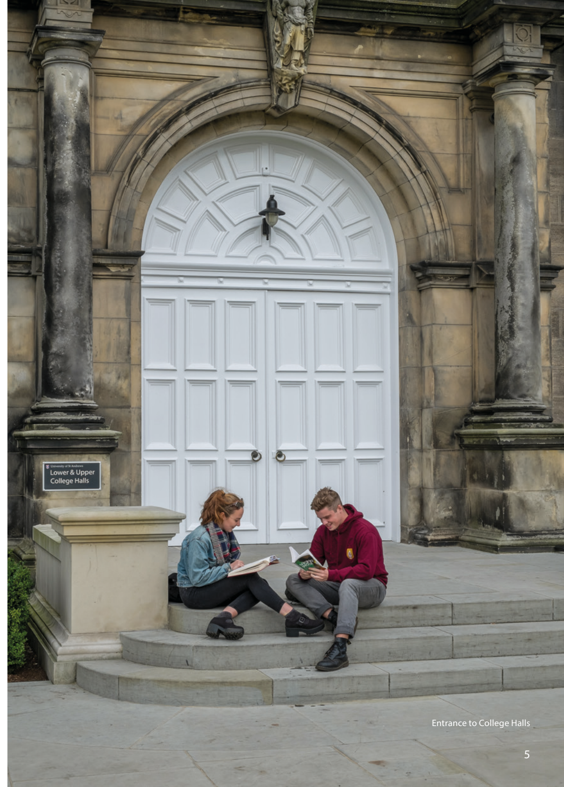
Entrance to College Halls