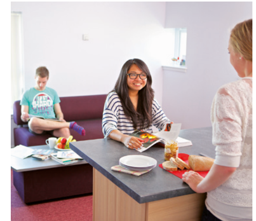
Our self-catered halls have communal kitchen areas to cook and socialise in.